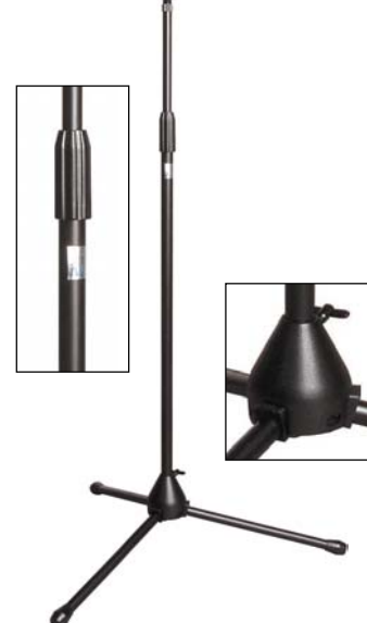
Deluxe Heavy Duty Tripod Microphone Stand