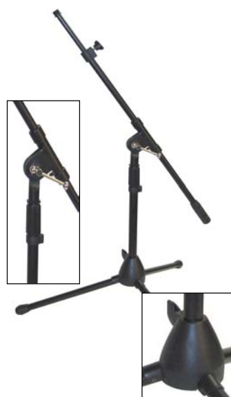
Mini Tripod Stand With Telescopic Boom