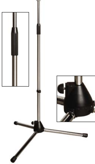
Heavy Duty Tripod Microphone Stand