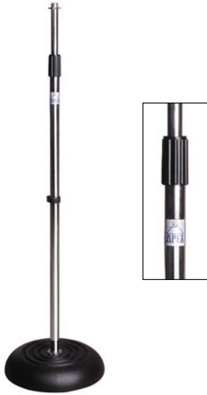
Economy Round Based Microphone Stand