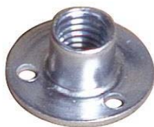
T-Nut For Pull Back 3/8" - 16