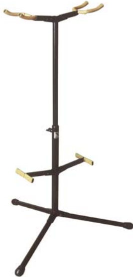
Double Guitar Stand Hanging Style