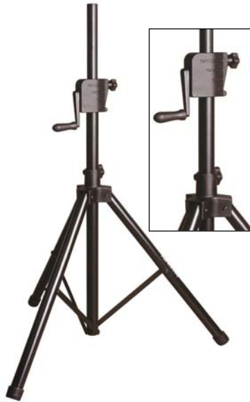
Crank-Up Adjustable Aluminum Speaker Stand