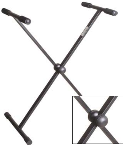
Single Tier / Single Brace Quick Folding X Stand - Claw Style Locking