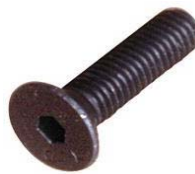
Flat Allen Head Bolt 3/8" - 16 x 1 1/4"