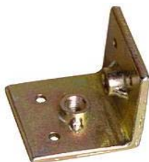
Internal Brace 3/8" - 16