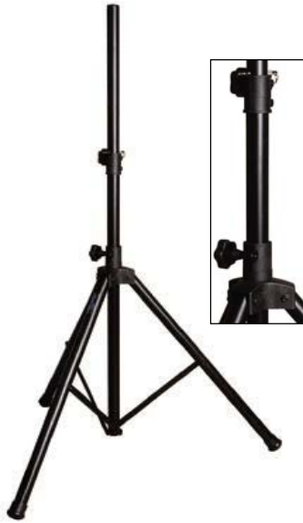
Economy Adjustable Aluminum Speaker Stand