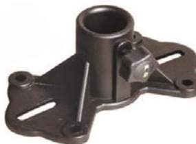
Exterior Mount Stand Flange With Knob