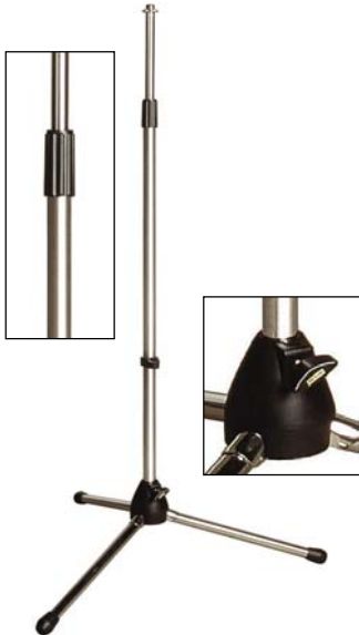
Economy Tripod Microphone Stand