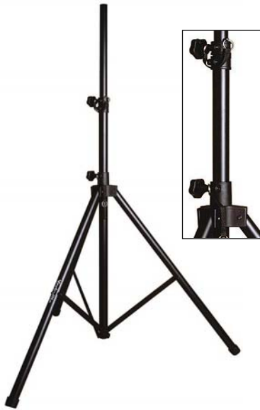
Extra Large Adjustable Aluminum Speaker Stand