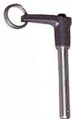
Quick Release Pin