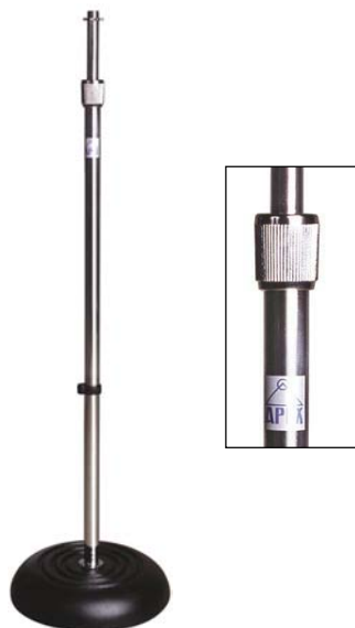
Round Based Microphone stand