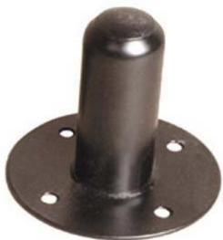
Cabinet Adaptor For Speaker Stands