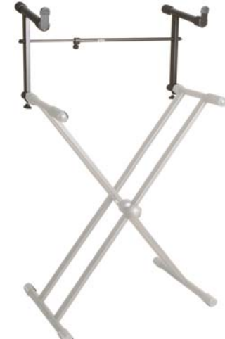
Single Stackable Tier for all IKS Stands (except IKS-5)