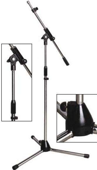
Deluxe Heavy Duty Tripod Stand With Telescopic Boom

APEX Tripod Base Microphone Stands With Booms