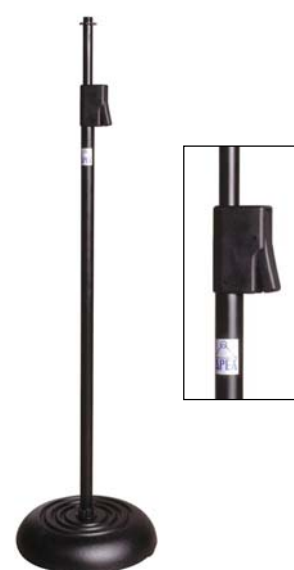
Quick Clutch Round Base Microphone stand