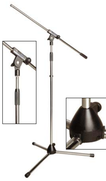
Heavy Duty Tripod Stand With Non Telescopic Boom