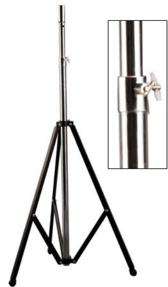
Heavy Duty All Metal Adjustable Speaker Stand