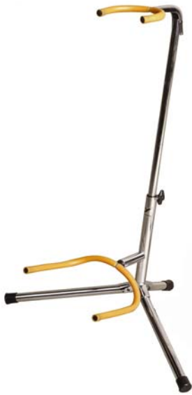
Economy Single Guitar Stand