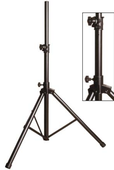
Adjustable Aluminum Speaker Stand