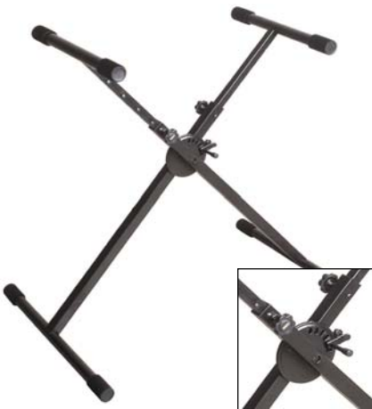
Single Tier / Single Brace Quick Folding Adjustable on Both Sides