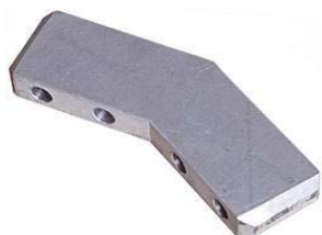
30 Degree Conecting Bar