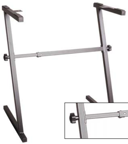
Collapsible Z Style Keyboard Stand