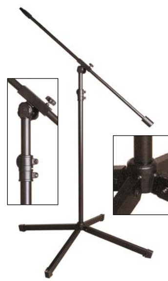
Large Heavy Duty Studio Tripod With Telescopic Boom