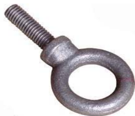
Forged Shoulder Eyebolt 3/8" - 16 x 1 1/4"