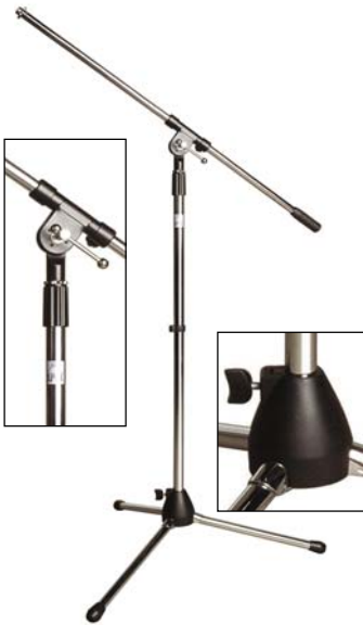
Economy Tripod Stand With Non Telescopic Boom

APEX Tripod Base Microphone Stands With Booms