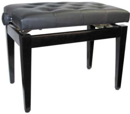
Deluxe Home Piano Bench With Height Adjustment