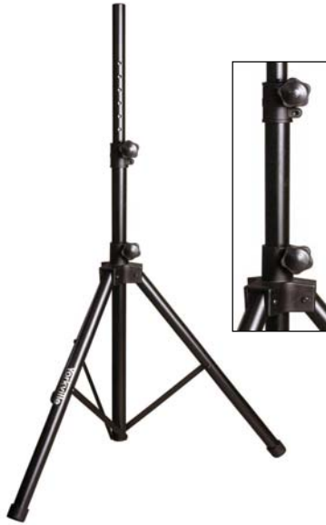
Economy Adjustable Steel Speaker Stand