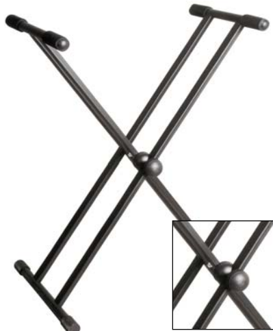
Single Tier / Dual Brace Quick Folding X Stand - Claw Style Locking