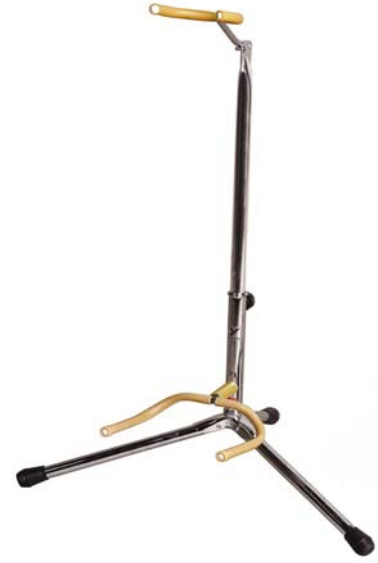
Basic Single Guitar Stand