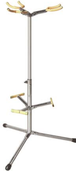
Triple Guitar Stand Hanging Style