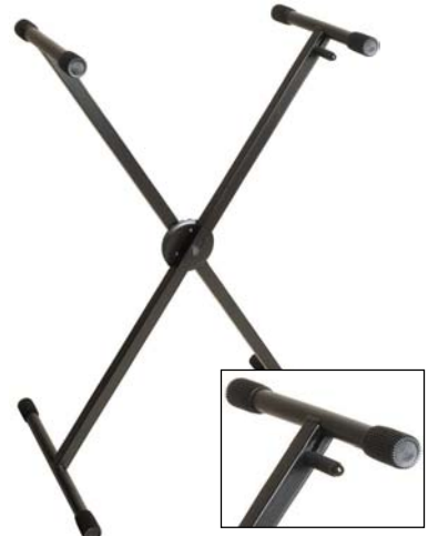
Deluxe Easy Set-Up Single Braced X Stand With Quick Release Lever