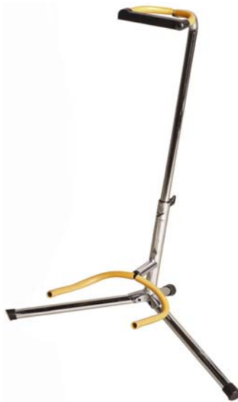
Economy Single Guitar Stand with Safety Guard