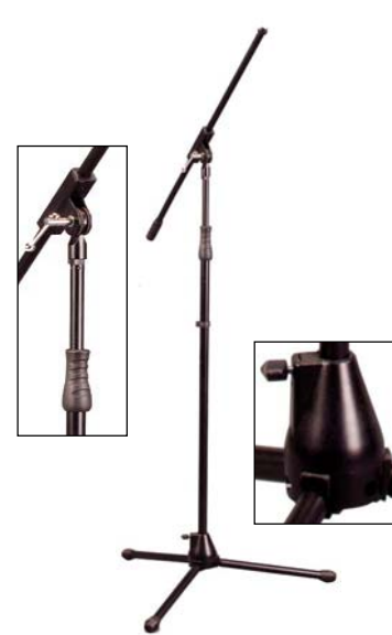
Deluxe Tripod Stand With Non Telescopic Boom