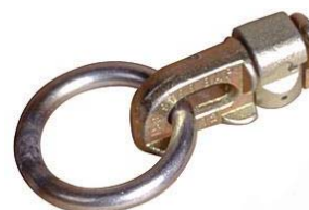
2 Stud Track Fitting 1000 lbs/ 453.6 kg Vertical