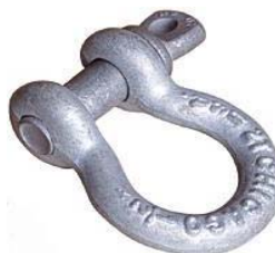
1/2" forged Shackle