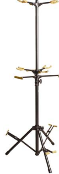
Dual Level Triple Guitar Stand Hanging Style